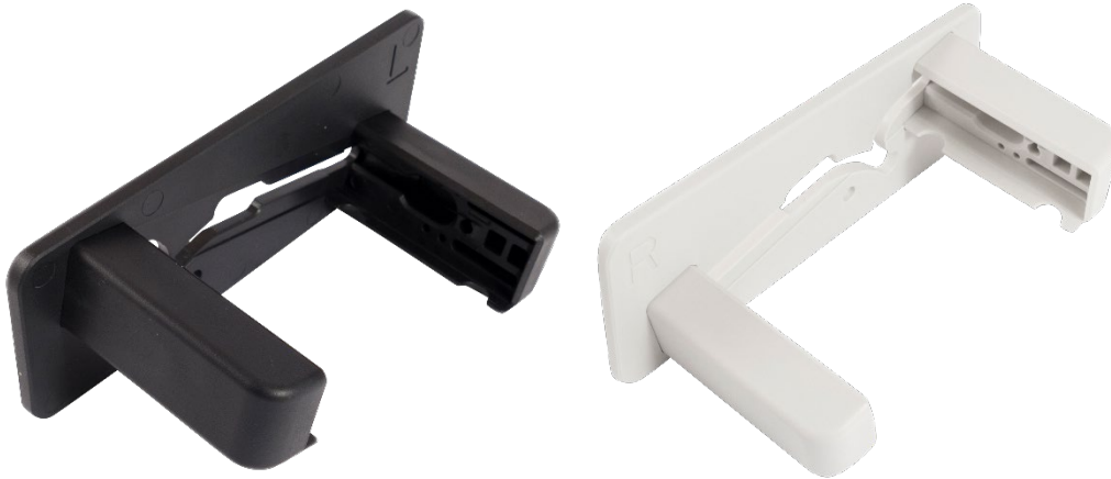
Bracket holder (exemplary illustrations)

Mounting solution for TWN3 and TWN4 MultiTech desktop readers