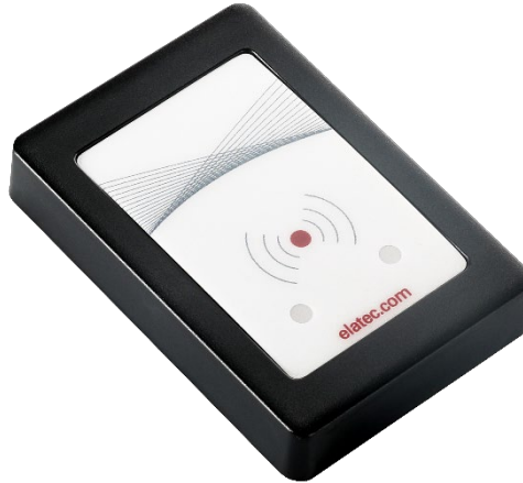
Panel housing for TWN4 MultiTech 2 modules (exemplary illustration)

for RFID modules of the TWN4 MultiTech 2 family